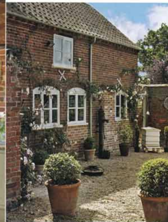
EXTERIOR TO FRONT

The property was built around 1750. www.norfolkcourtyard.co.uk; 01362 683333.